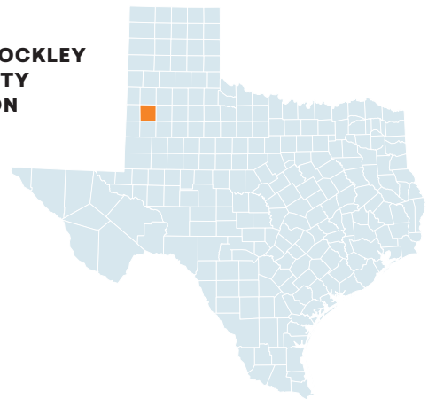
THE HOCKLEY COUNTY REGION

All results reflect student and financial data for fiscal year (FY) 2015-16. Impacts on the county business community are reported under the economic impact analysis. Results are measured in terms of added income.